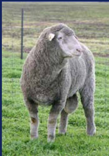
KDS100107 Sold at National Premier Sire Sale Aug 2013 to Coolibar Dohne Stud for $4500.