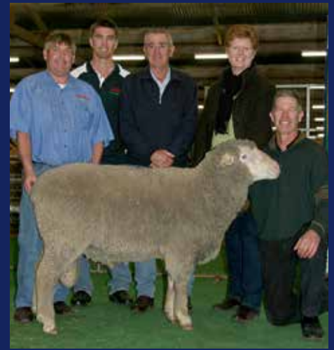
KDS100107 Sold at National Premier Sire Sale Aug 2013 to Coolibar Dohne Merino Stud for $4500.